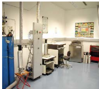
Gravimetric Preparation Apparatus