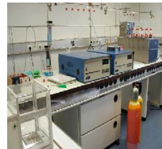
Dynamic Generation Equipment

The Reference Gas Laboratory is responsible for the production, development and maintenance of the gas mixtures national primary standards, handling to do: